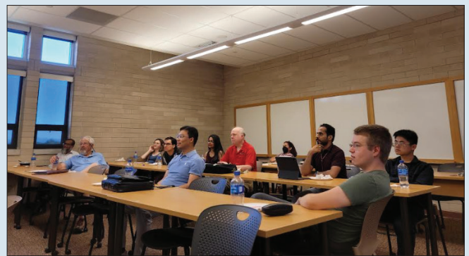
University of Denver COMSOC Meeting (students and ICC 2024 Committee)

Another thing we are doing is co-hosting more events with other societies and geographical chapters. Co-hosting allows us to offer a greater quantity and diversity of technical talks than what we would do alone. Several of our events are applicable