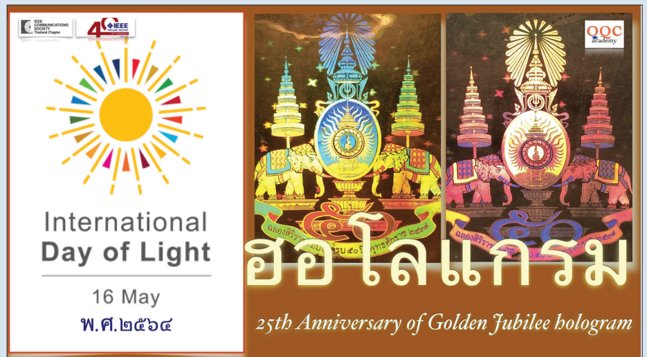
Poster and video thumbnail of an IDL2021 talk – 25th anniversary of the golden jubilee hologram (1996–2021)

Finally, Thai ComSoc chapter would like to thank all IDL2021’s supporters; 1) IEEE photonics society (educational seed funding) 2) institute for the promotion of teaching science and technology (IPST) 3) electricity generating authority of Thailand (EGAT) and 4) metropolitan electricity authority (MEA), for their kindness to co-enlighten people on technology development with fraud prevention.